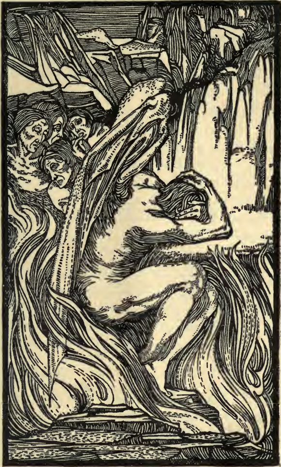
—“The eternal fire Unquenchable, with chilling frosts commingled.”